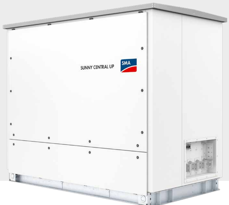
Central Inverter Sunny Central UP Power class up to 4,600 kVA

The “DC Coupling Ready” option offers the possibility of obtaining a Sunny Central central inverter with six battery inputs. This means that a battery storage system coupled on the DC side can be retrofitted easily and cost-effectively at any time – when battery prices have fallen further, for example.